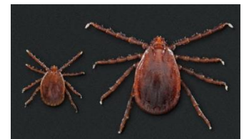
Juvenile and adult Asian longhorned tick

https://www.newsweek.com/asian-longhorned-tick-cdc-warning-1844442